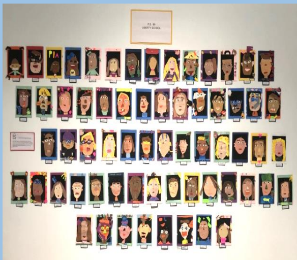
Second Grade self-portraits